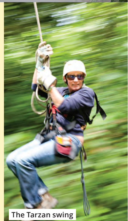
The Tarzan swing

Now here we are in Costa Rica. Today we rode on the Monteverde Extremo and the Tarzan swing. They were really frightening , but a great thing to do! I recommend them to everyone.