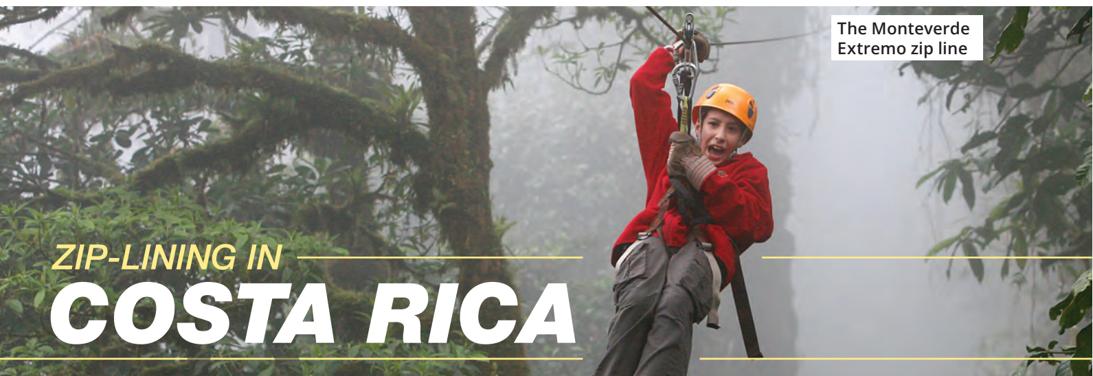
The Monteverde Extremo zip line

If you're looking for an adventure vacation, this is it! In Costa Rica, there are zip lines over the rainforests. A zip line is a cable . Costa Rica has the longest zip line in Latin America, the Monteverde Extremo, which is 1,590 meters long. Parts of it are more than 400 meters above the ground, and there are 14 platforms . You stand on the platform, attach yourself to the cable, and fly down the zip line over the trees! There is also a Tarzan swing . You can hold onto a rope and swing over a valley . It looks really dangerous. I can't imagine doing something like this. I'm not very athletic .