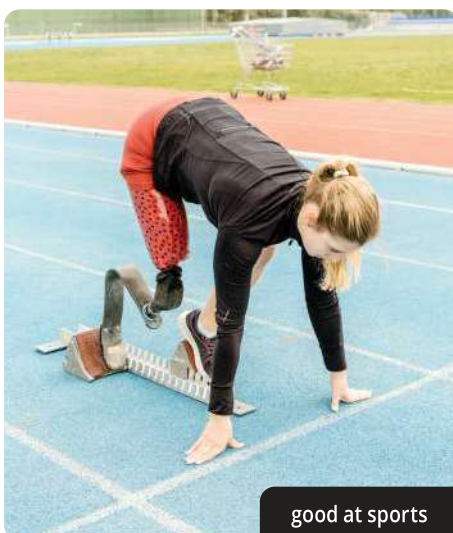
good at sports