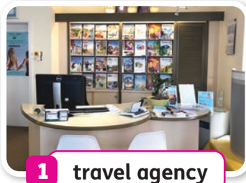
1 travel agency