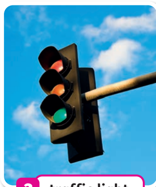
3 traffic light