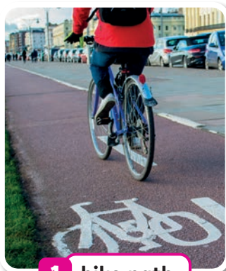
1 bike path