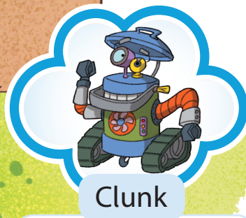
Clunk Grandpa's robot