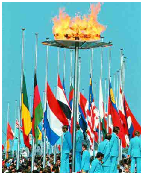
Flags at half-mast after the deaths of eleven Israeli athletes, Munich 1972

In 1980, only eighty countries went to the Moscow Games because the Russian army had entered Afghanistan: once again it seemed possible that the Olympic Games would not go on. In 1984, the Russians and some other countries did not go to Los Angeles. But, although there have been problems, the Games have continued. 169 countries went to the 1992 Games in Barcelona which were happy and very successful.